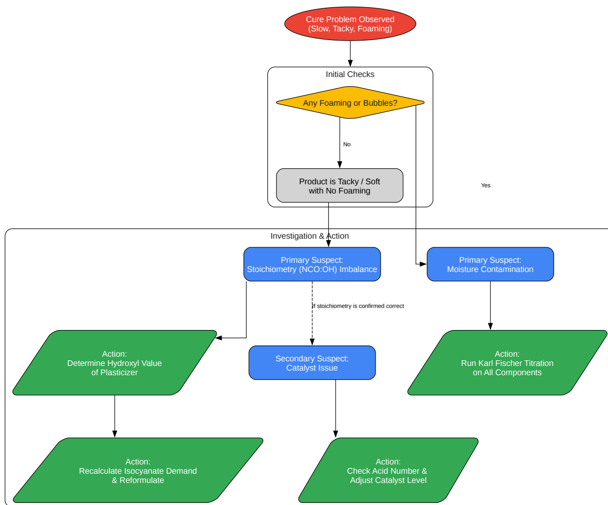
Troubleshooting Workflow for Cure Interference

Click to download full resolution via product page