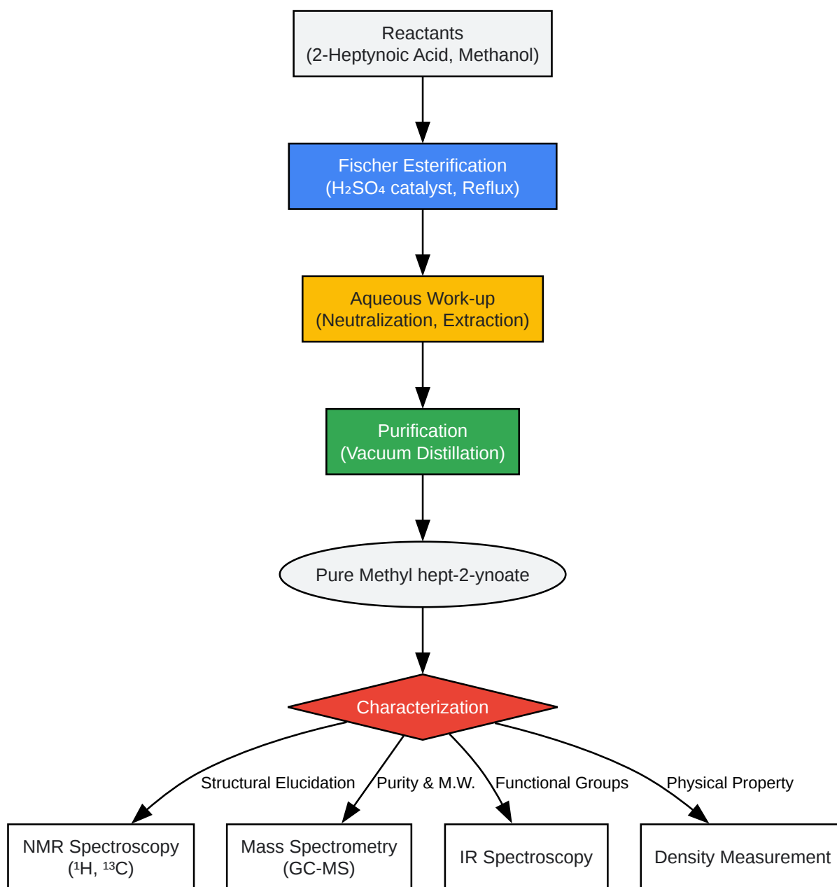
Figure 1: General Workflow for Synthesis and Characterization

Click to download full resolution via product page