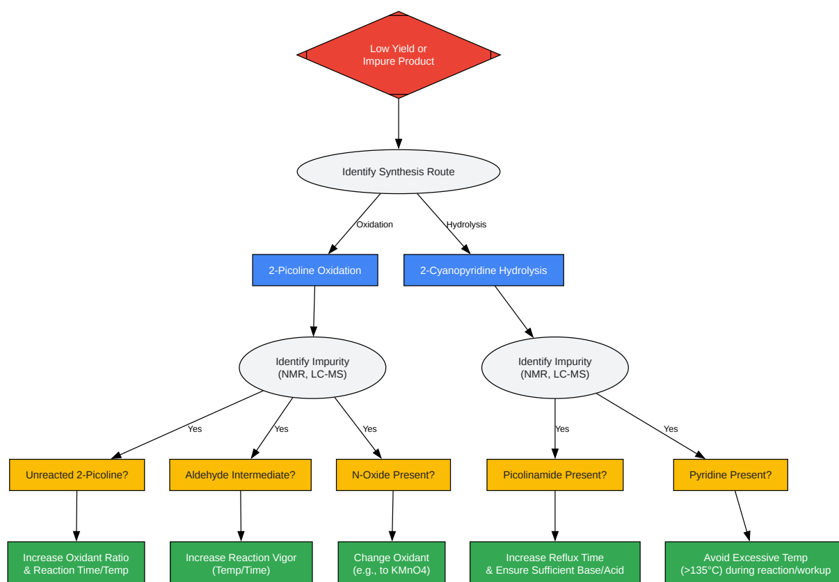
Diagram: Troubleshooting Workflow for Picolinic Acid Synthesis