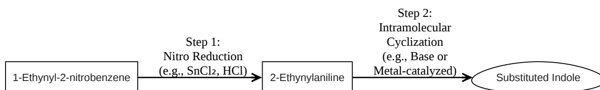
Diagram 3: Synthesis of Indole from 1-Ethynyl-2-nitrobenzene

Click to download full resolution via product page