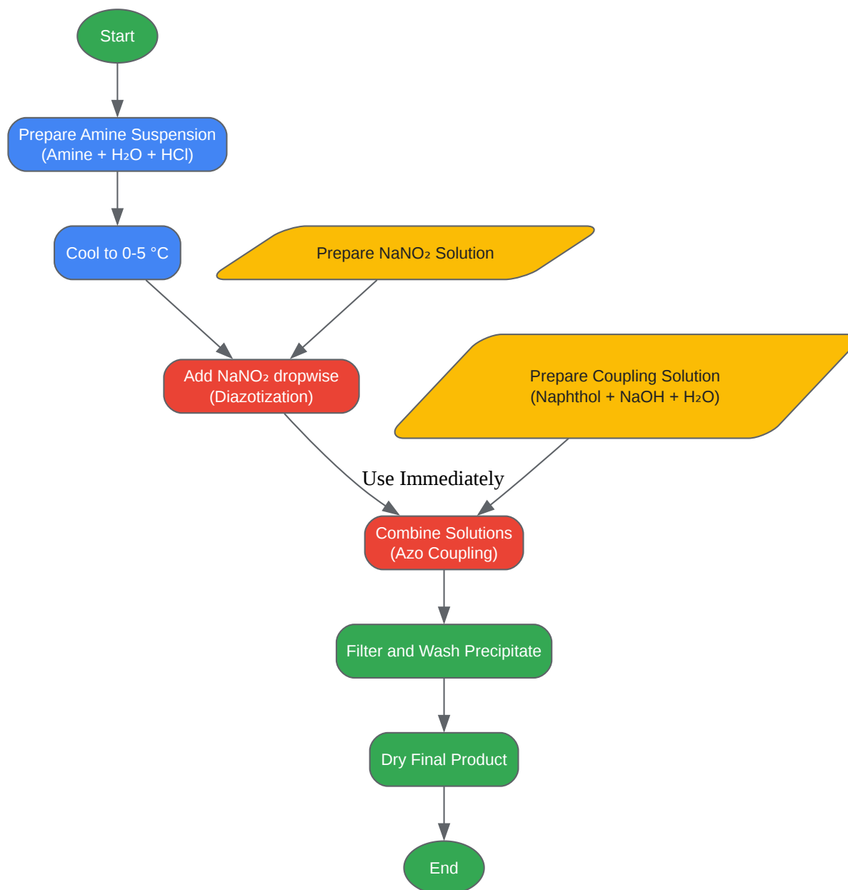
Experimental Workflow for Azo Pigment Synthesis

Click to download full resolution via product page