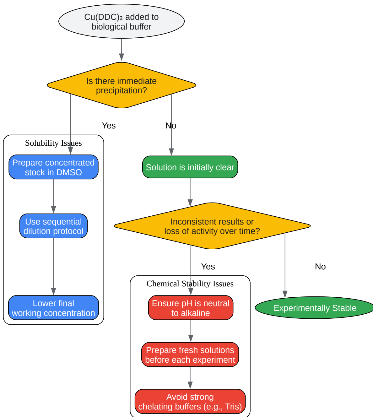
Caption: Experimental workflow for assessing the stability of Cu(DDC) 2 .

Click to download full resolution via product page