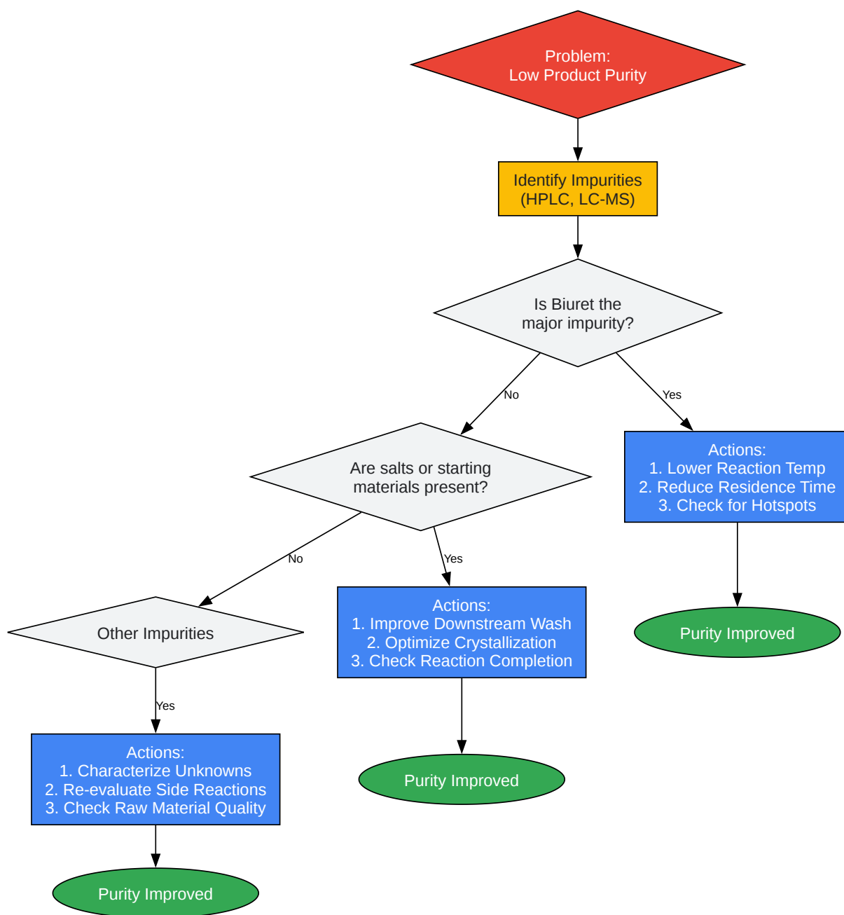
Diagram 2: Troubleshooting Low Purity

Click to download full resolution via product page