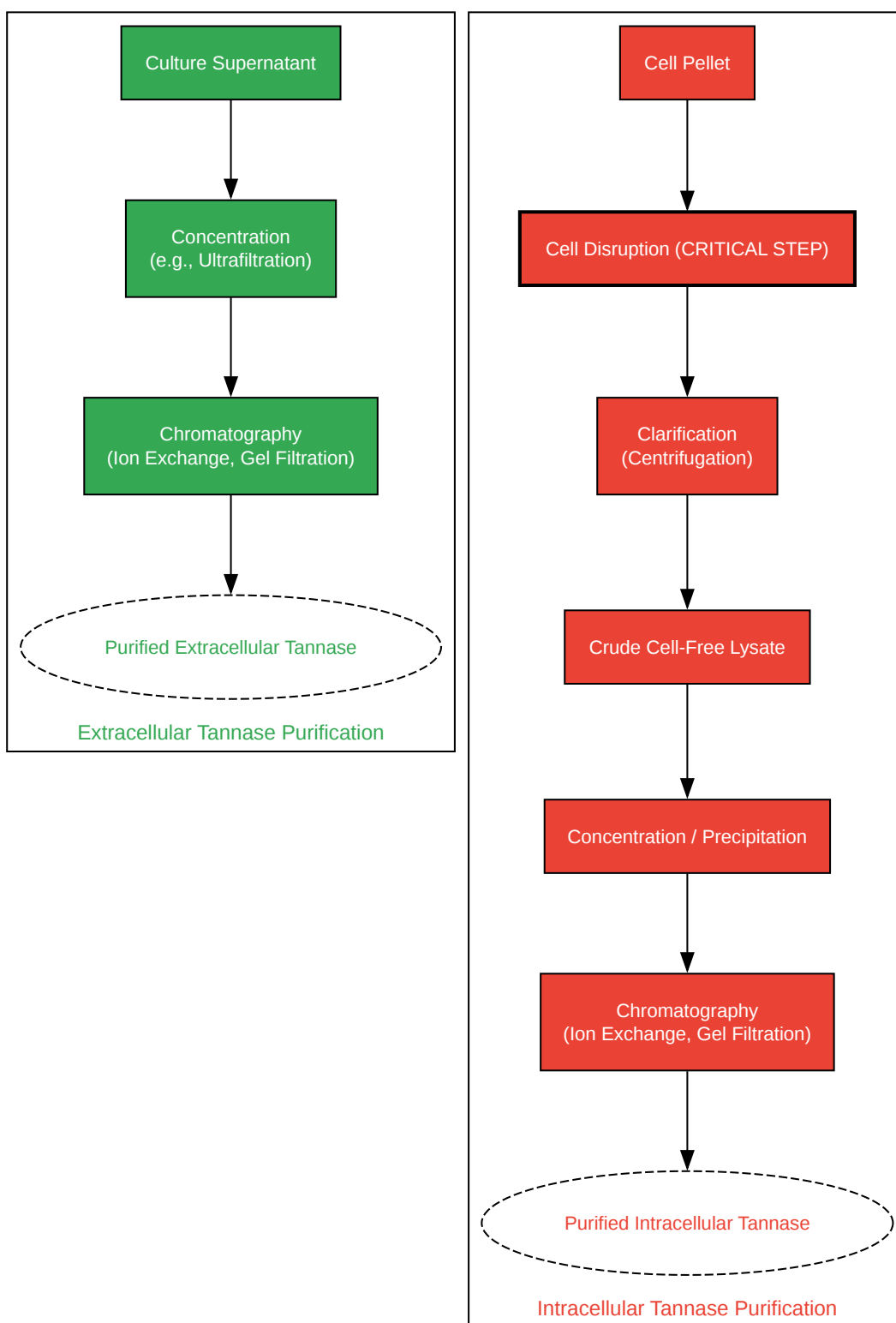
Comparative Purification Workflow

Click to download full resolution via product page