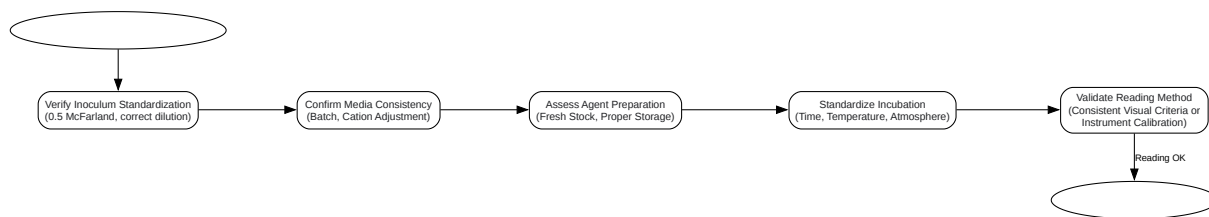
Diagram 1: Troubleshooting Workflow for Inconsistent MIC Results

Click to download full resolution via product page