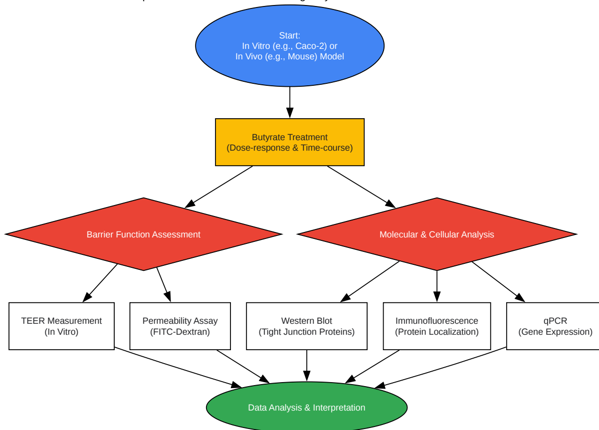
Experimental Workflow for Assessing Butyrate's Effect on Barrier Function

Click to download full resolution via product page