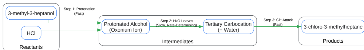
Figure 1: SN1 Synthesis Pathway

Click to download full resolution via product page