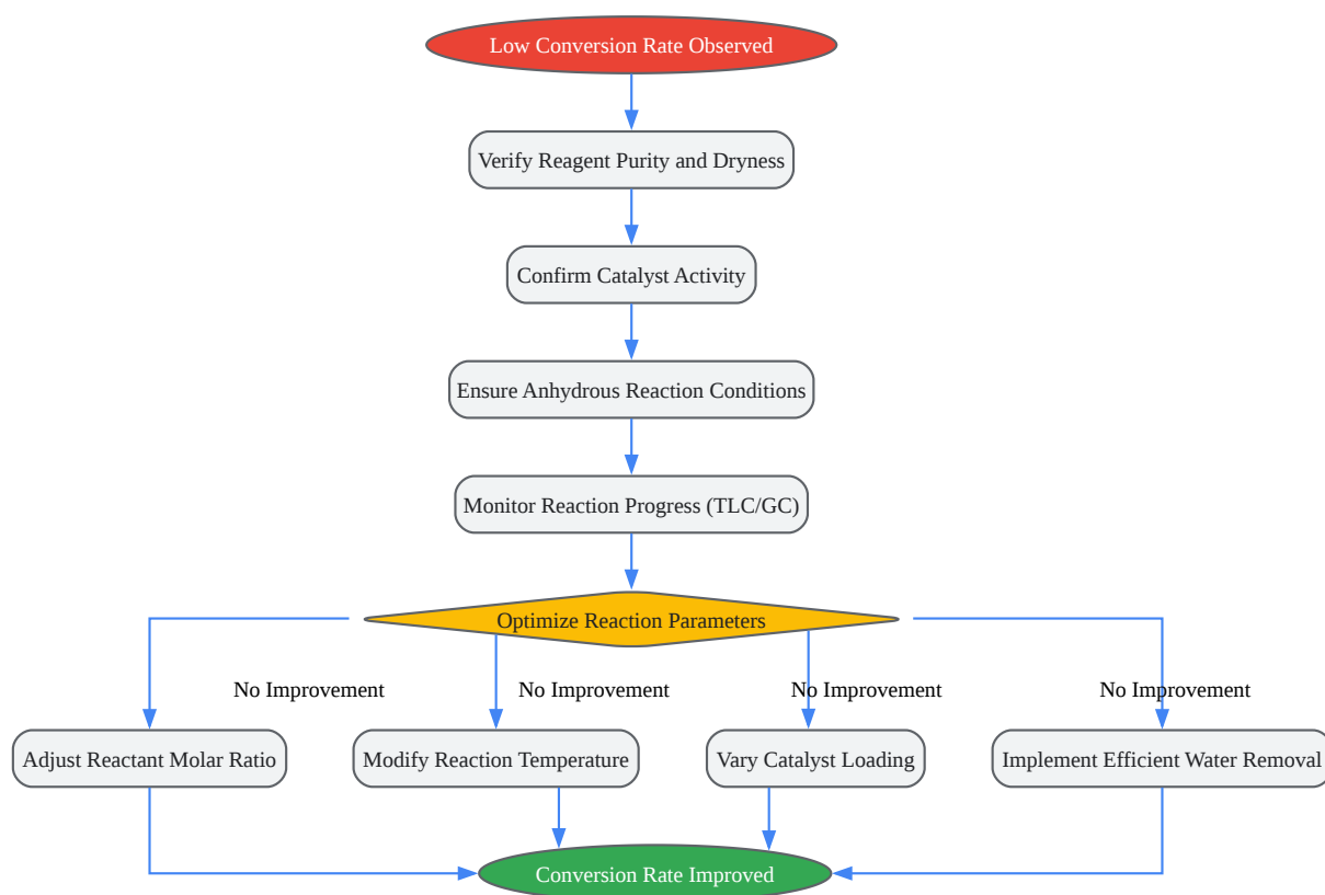
Diagram: Troubleshooting Workflow for Low Conversion Rates

Click to download full resolution via product page