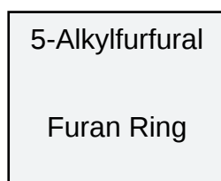
General Structure of 5-Alkylfurfurals

Click to download full resolution via product page