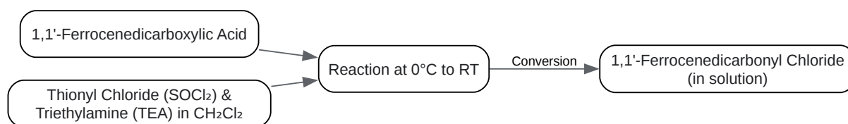
Diagram of Monomer Synthesis Workflow

Click to download full resolution via product page