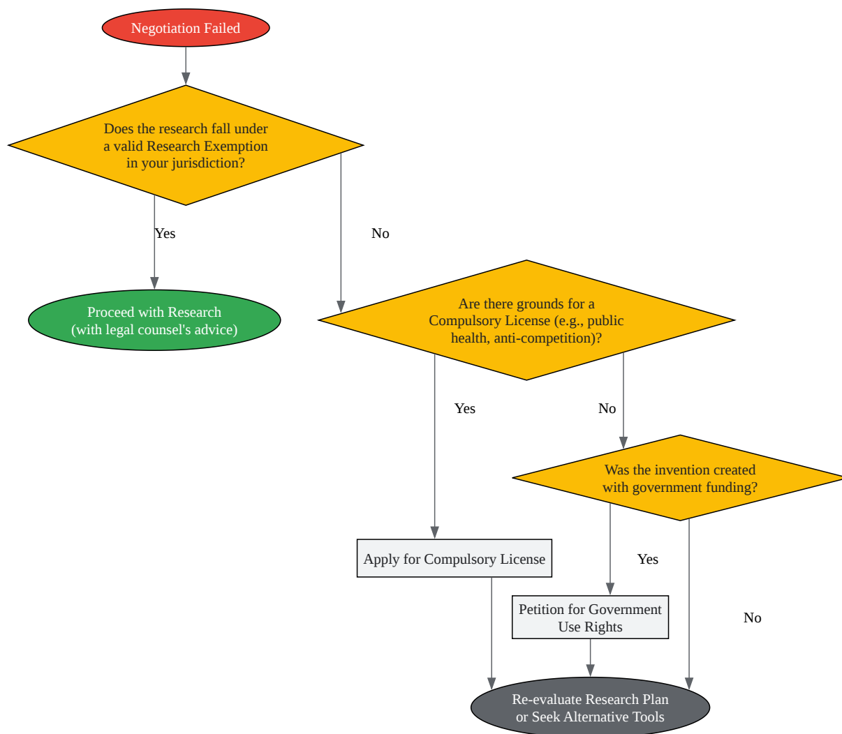
Diagram 2: Decision Tree for Legal Pathways

Click to download full resolution via product page