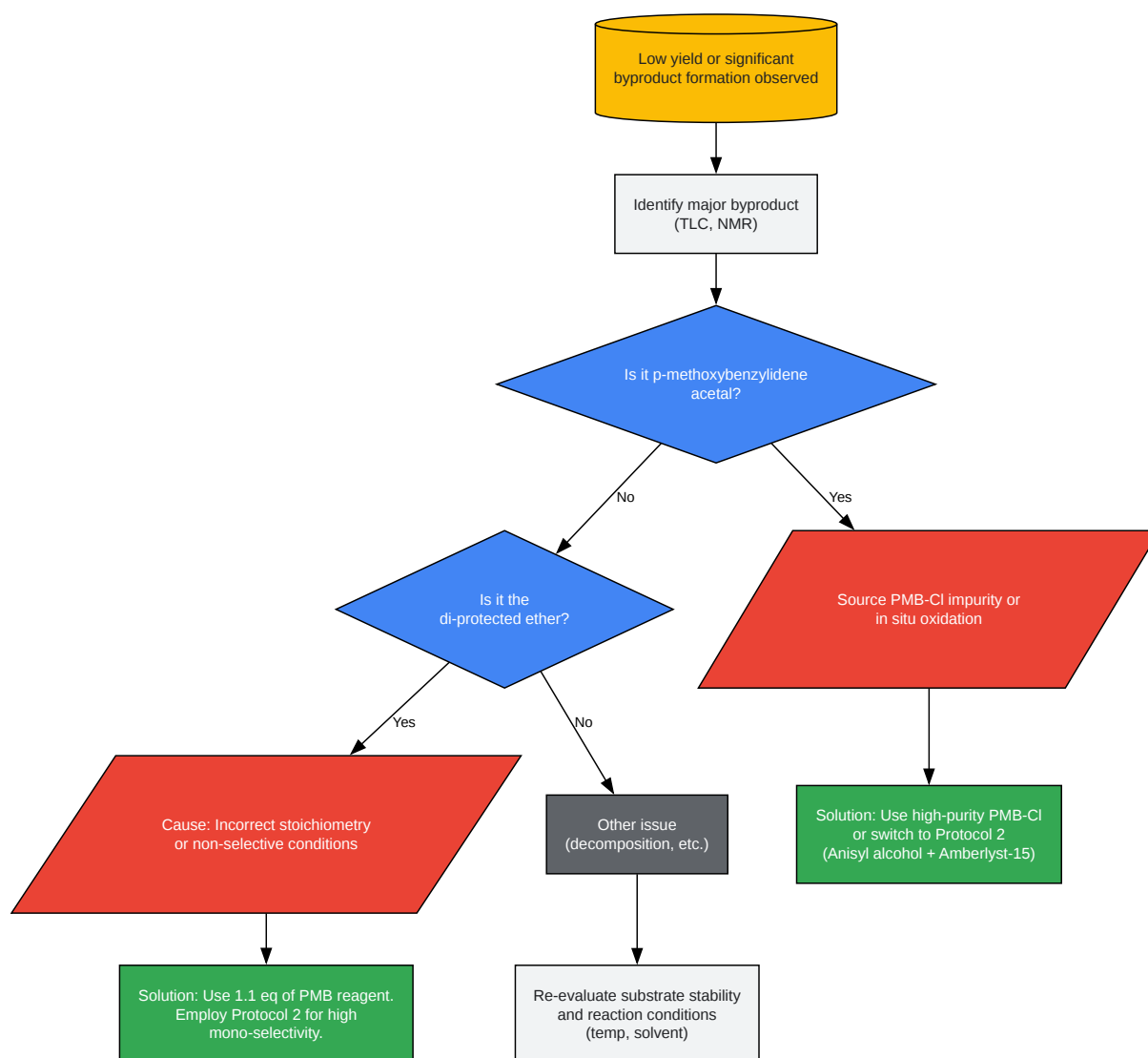
Figure 2. Troubleshooting Byproduct Formation

Click to download full resolution via product page