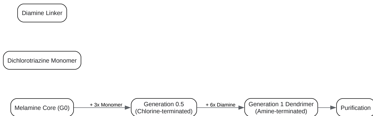
Diagram 1: Divergent Synthesis Workflow

Click to download full resolution via product page