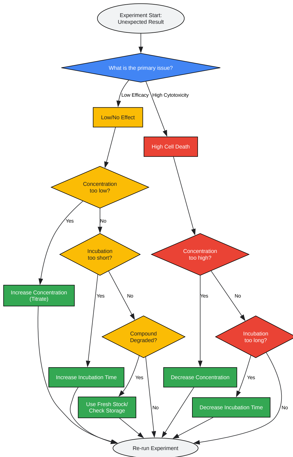
Troubleshooting Logic for Monensin Experiments

Caption: A stepwise experimental workflow for determining optimal monensin concentration and incubation time.