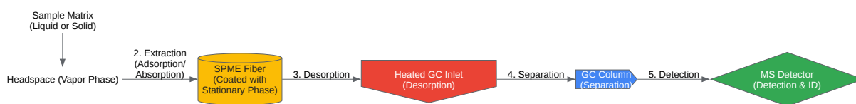
Figure 1: Principle of HS-SPME Analysis

is retracted and transferred to the heated injection port of a gas chromatograph, where the analytes are thermally desorbed for separation and analysis.