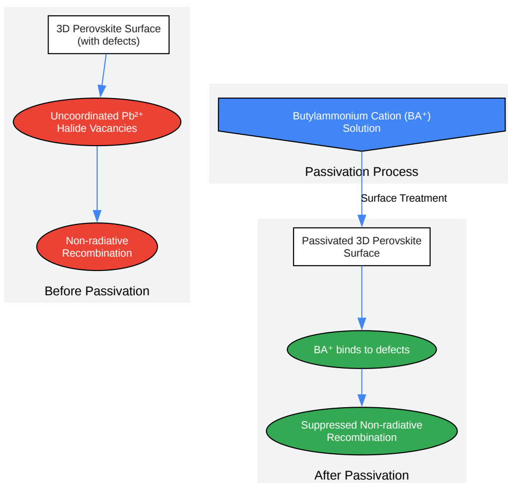
Figure 1: Butylammonium Defect Passivation Mechanism

Click to download full resolution via product page