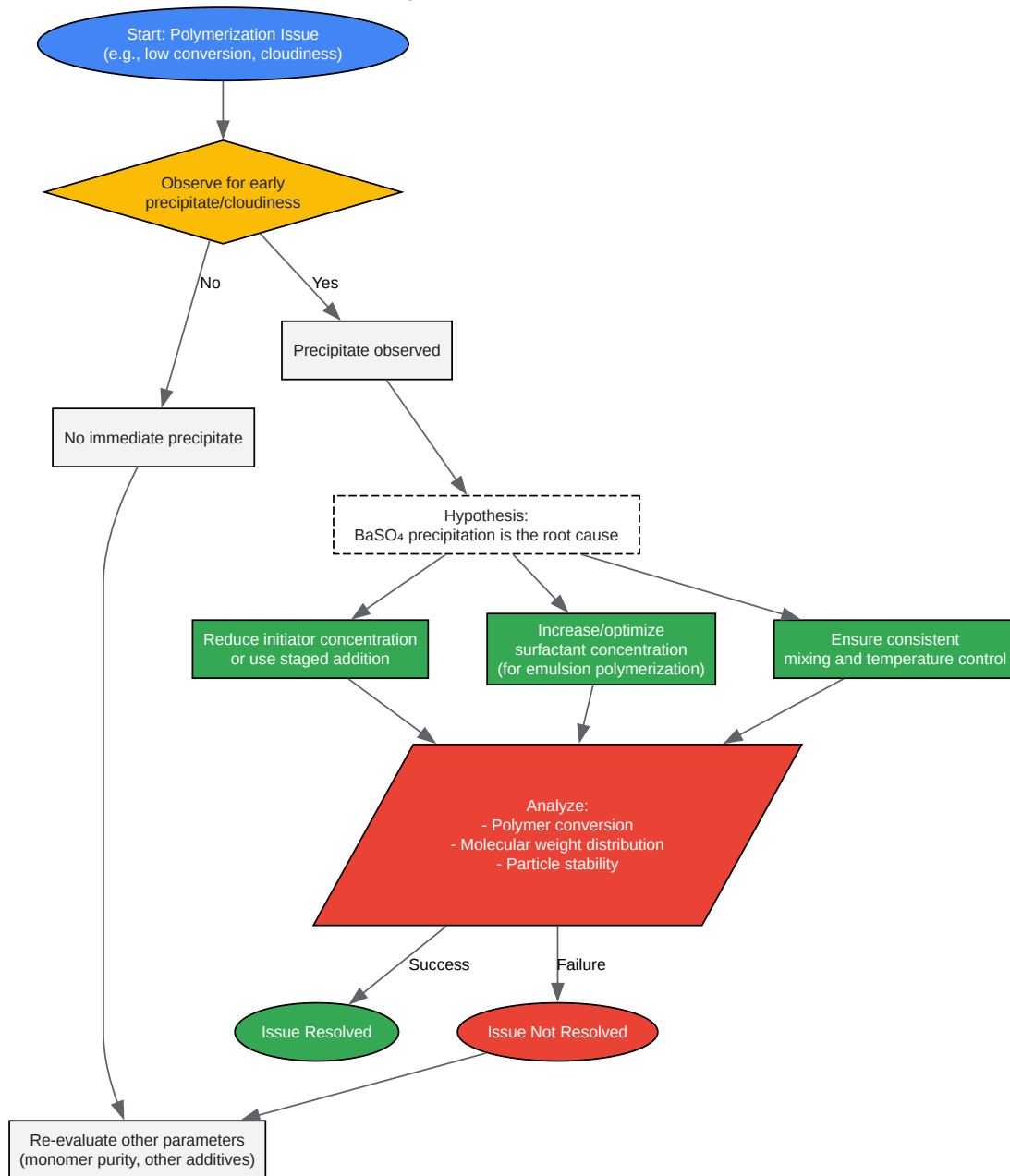
Troubleshooting Workflow for Barium Persulfate Issues