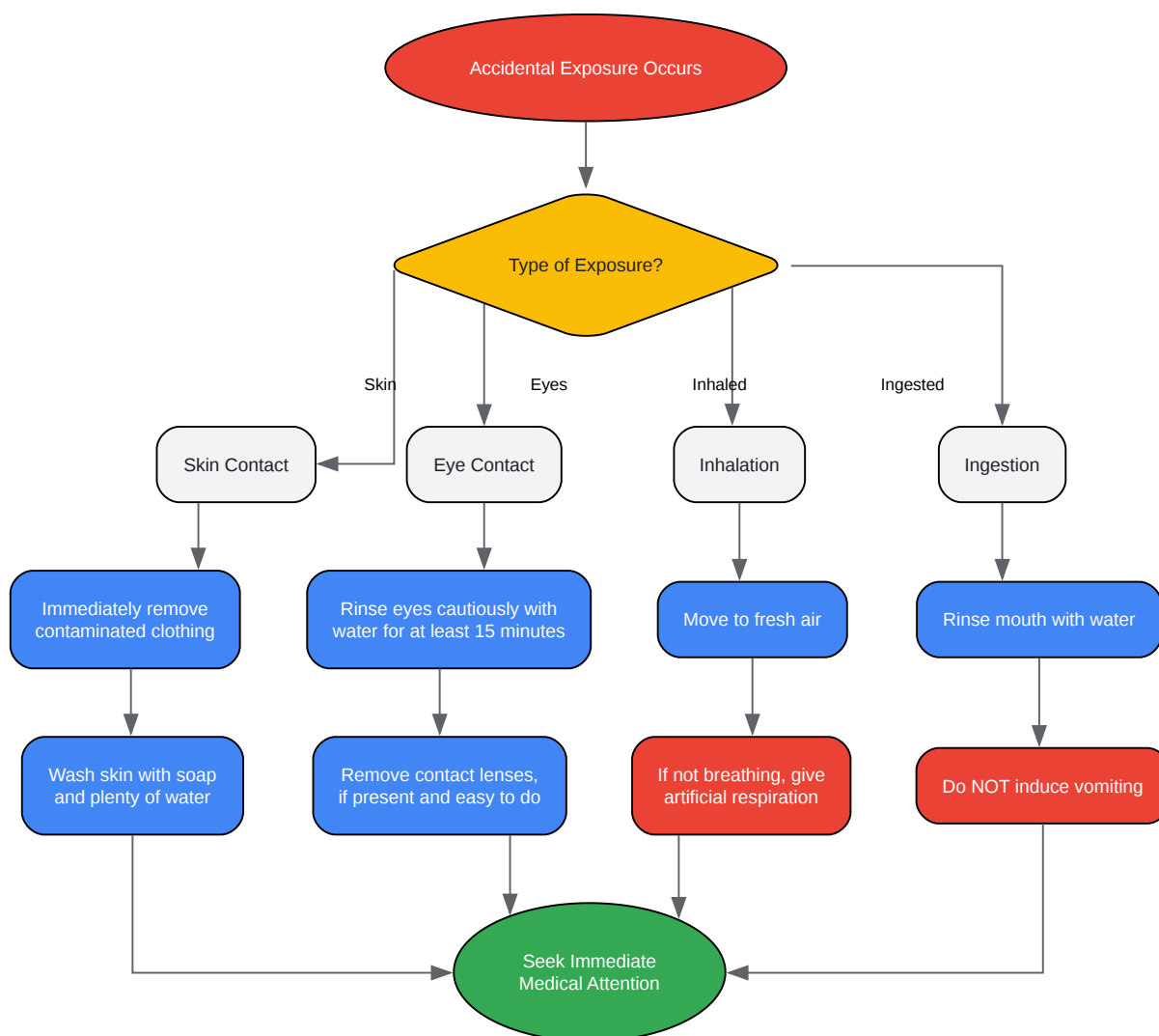
Diagram 2: Emergency Response for Accidental Exposure

Click to download full resolution via product page