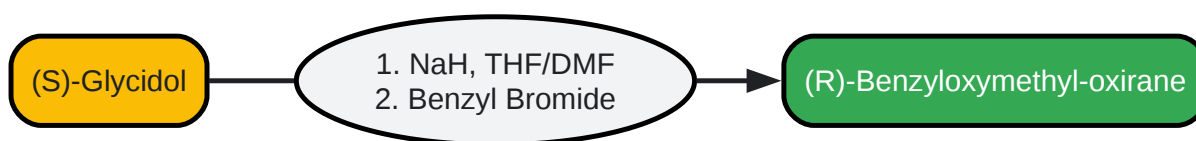
Diagram of the Synthesis from (S)-Glycidol:

Click to download full resolution via product page