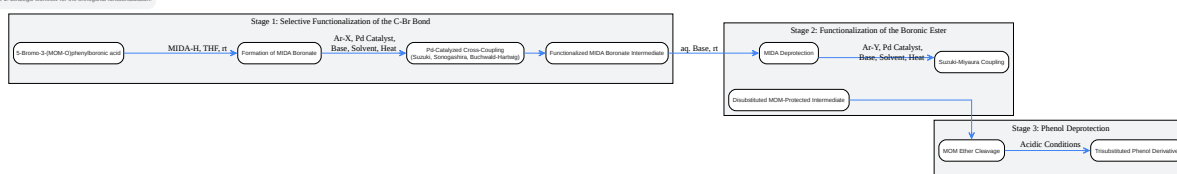
Figure 1. Strategic workflow for the orthogonal functionalization.

Click to download full resolution via product page