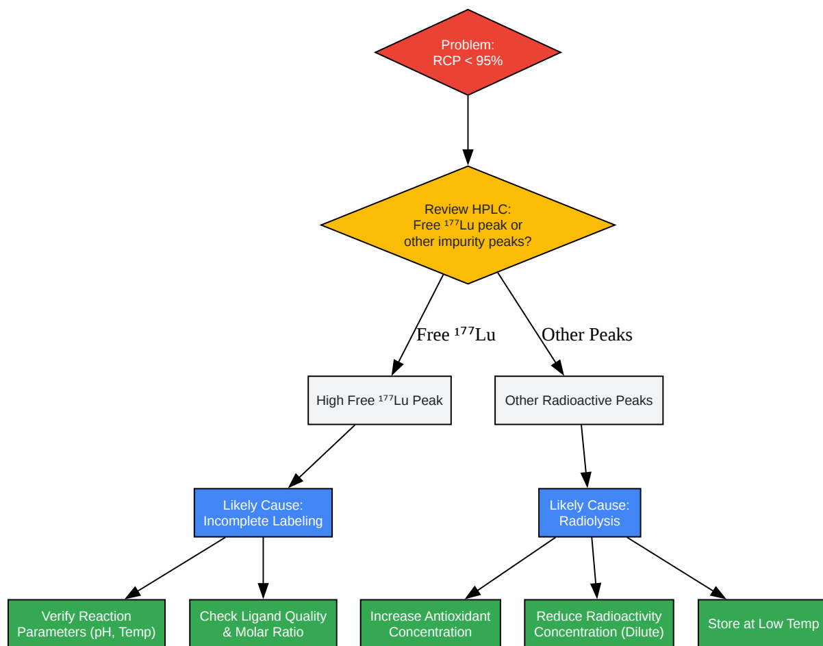
Figure 2. Troubleshooting Logic for Low Radiochemical Purity (RCP).

Click to download full resolution via product page