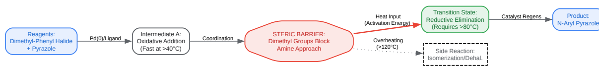
Fig 1. The Steric Energy Barrier in Dimethyl-Phenylene Couplings

Click to download full resolution via product page