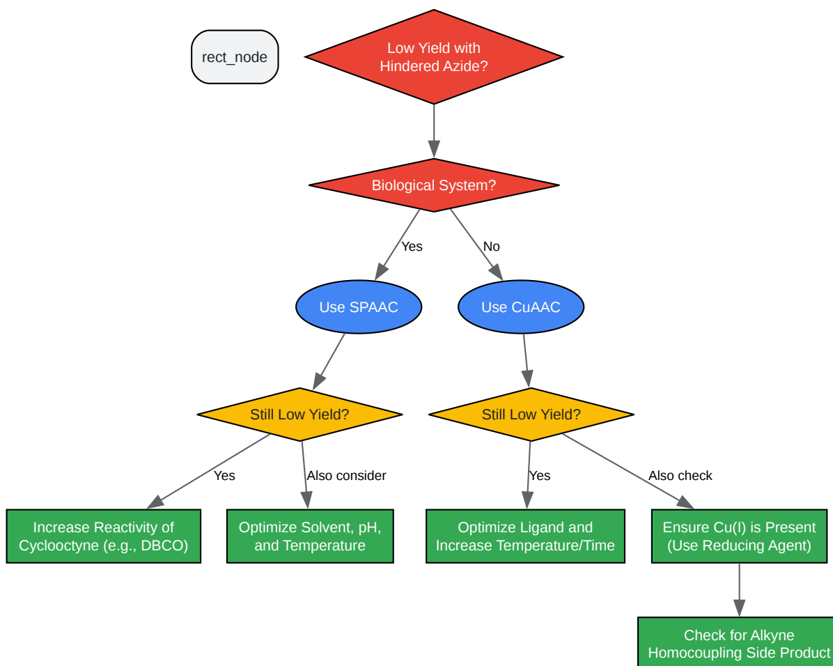
Figure 3. Troubleshooting Logic for Hindered Azide Reactions

Click to download full resolution via product page