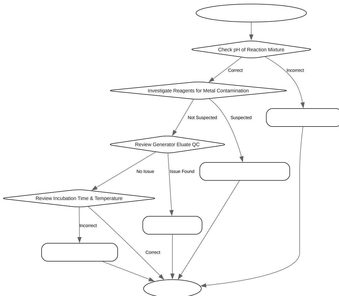
Figure 2: Troubleshooting Low Radiolabeling Efficiency

Caption: Quality Control Workflow for ^{113\text{m}}\text{In} Radiopharmaceuticals.