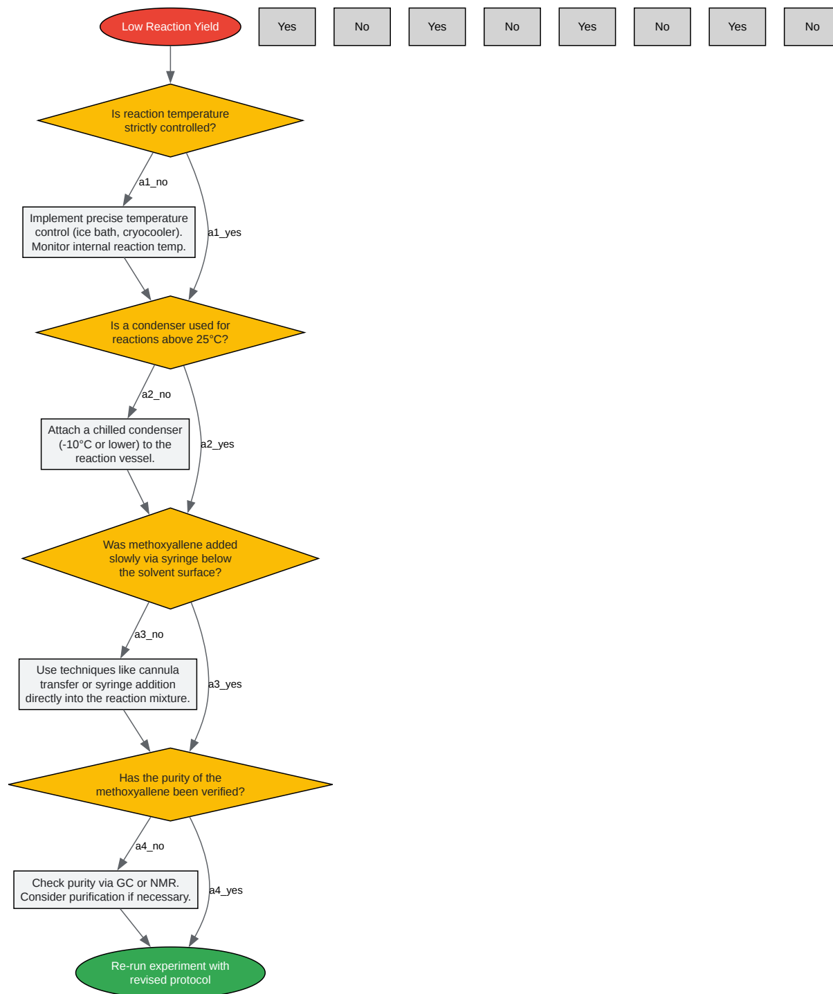
Diagram 2: Troubleshooting Low Reaction Yield

Click to download full resolution via product page