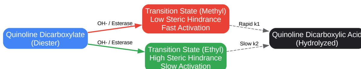
Figure 1: Comparative Hydrolysis Kinetics. The ethyl group raises the activation energy barrier.