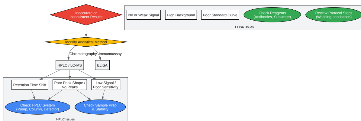
Diagram 1: General Troubleshooting Workflow

Click to download full resolution via product page