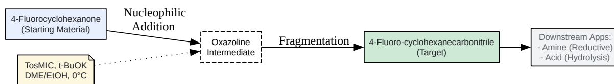
Diagram 2: Synthetic Workflow

Click to download full resolution via product page