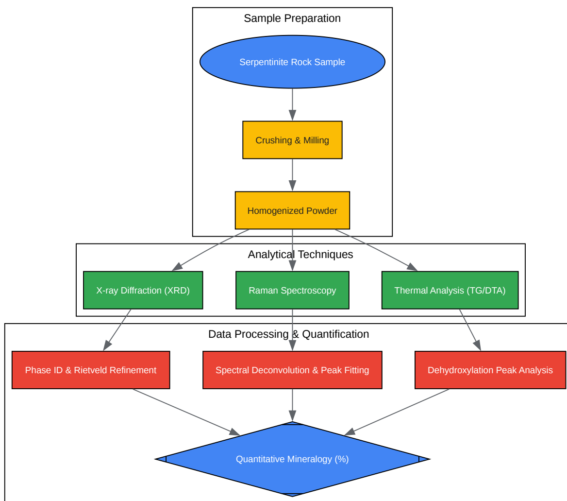
Workflow for Quantitative Analysis of Serpentine Minerals

Click to download full resolution via product page