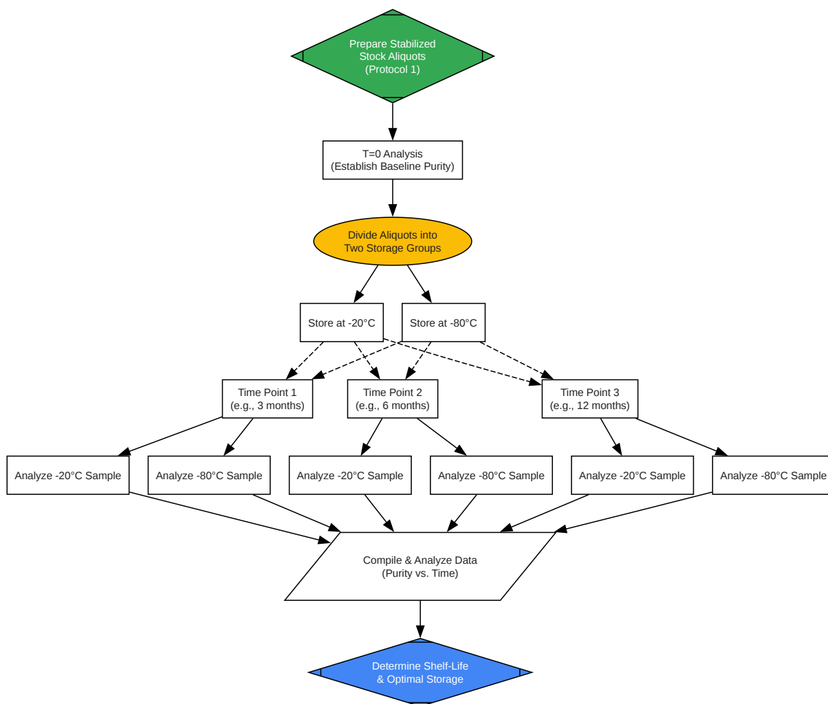
Figure 2: Workflow for a Long-Term Stability Study

Click to download full resolution via product page