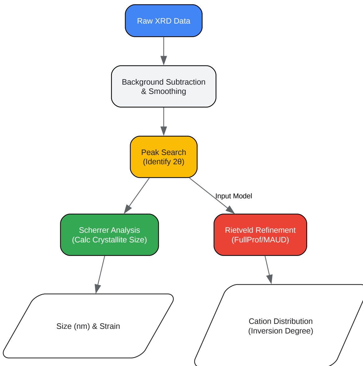
Diagram 2: Analysis Logic

Click to download full resolution via product page