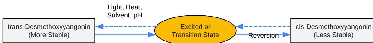
Figure 1: Proposed Isomerization Pathway of Desmethoxyyangonin

The following diagrams illustrate the isomerization pathway and a recommended experimental workflow.