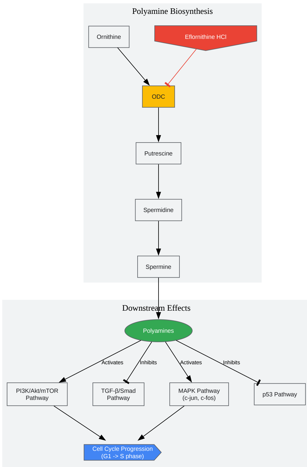
Diagram 3: Polyamine Biosynthesis and Downstream Signaling