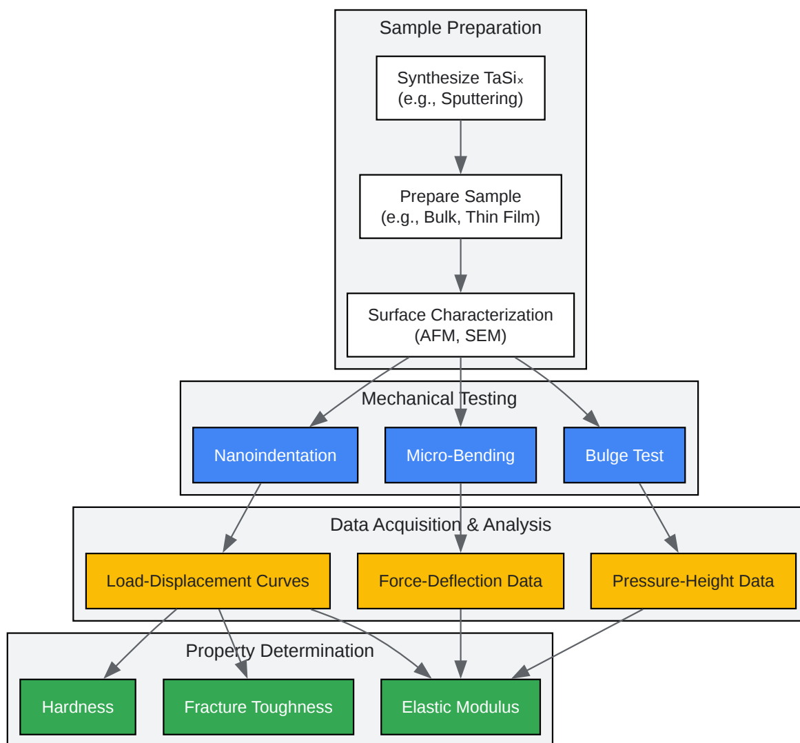
Experimental Workflow for Mechanical Characterization

Click to download full resolution via product page