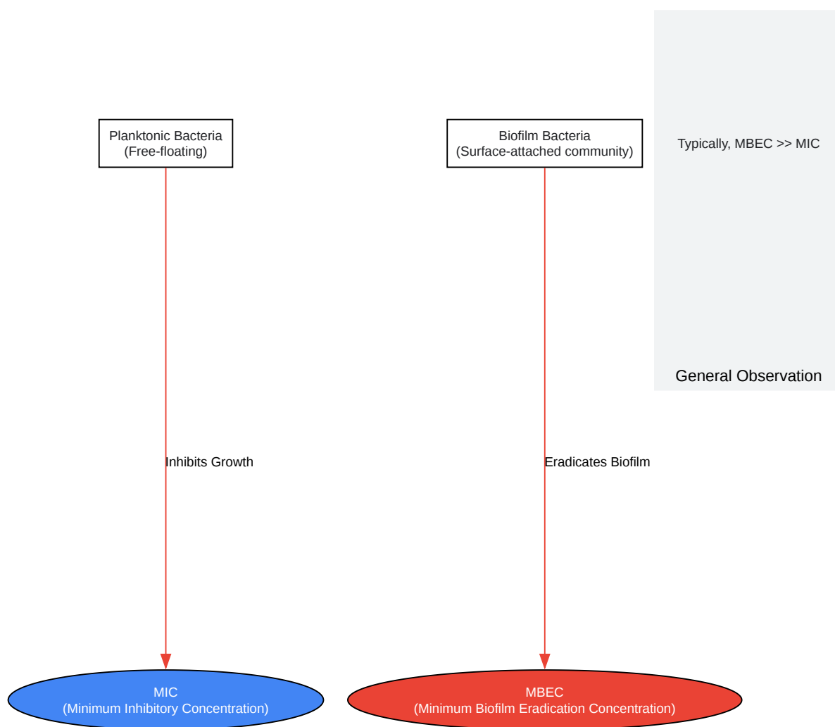
Logical Relationship between MIC and MBEC

Click to download full resolution via product page