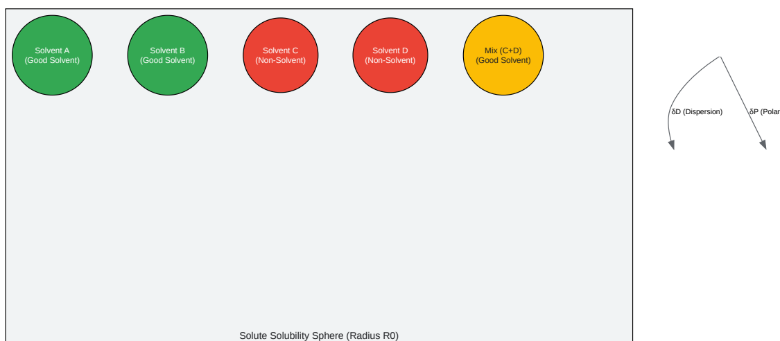
Figure 1: Hansen Solubility Sphere Concept

A polymer or other solute is not defined by a single point in this 3D "Hansen space" but by a "solubility sphere." A solvent whose HSP coordinates fall within this sphere will dissolve the solute. This predictive power is invaluable; for instance, it can explain why a mixture of two non-solvents can, in fact, become a good solvent if the combined HSP of the blend falls within the solute's sphere. [16]