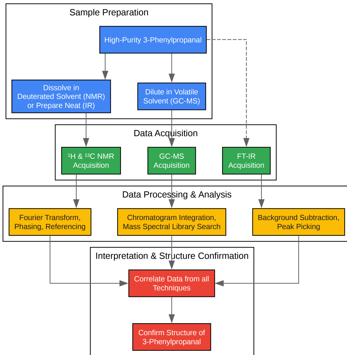
Figure 1. General Workflow for Spectroscopic Analysis of 3-Phenylpropanal

Click to download full resolution via product page