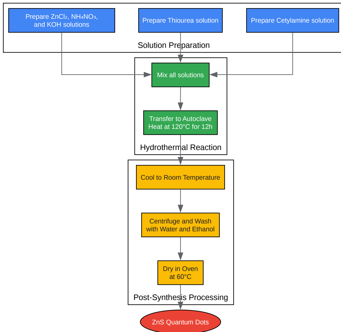
Workflow for Hydrothermal Synthesis of ZnS Quantum Dots

Click to download full resolution via product page