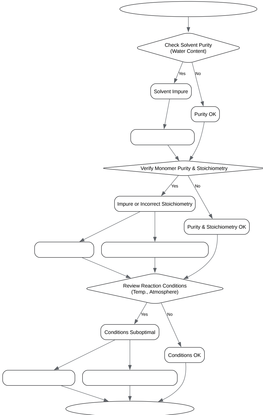
Troubleshooting BAPP Polymerization Issues

Click to download full resolution via product page