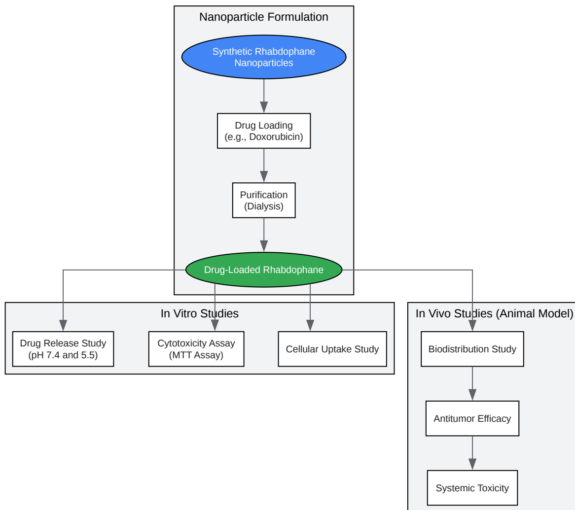
Experimental Workflow for Rhabdophane-Based Drug Delivery

Click to download full resolution via product page