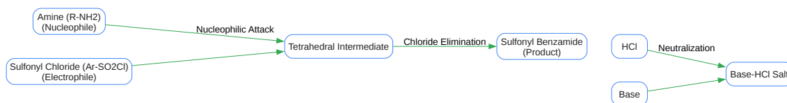
Figure 1: Mechanism of Sulfonyl Benzamide Formation.