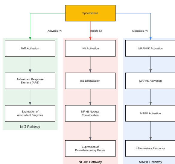
Figure 3 illustrates the potential, yet to be fully elucidated, interactions of Spheroidene with key inflammatory signaling pathways based on the known activities of other carotenoids. Direct experimental validation for Spheroidene is required.

Click to download full resolution via product page