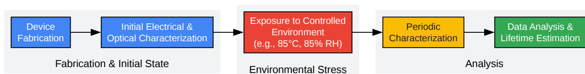
Figure 2: Workflow for Stability Testing

The following diagram outlines a typical experimental workflow for evaluating the environmental stability of thin-film devices.