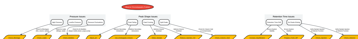
Diagram: Troubleshooting Logic for HPLC Issues

Click to download full resolution via product page