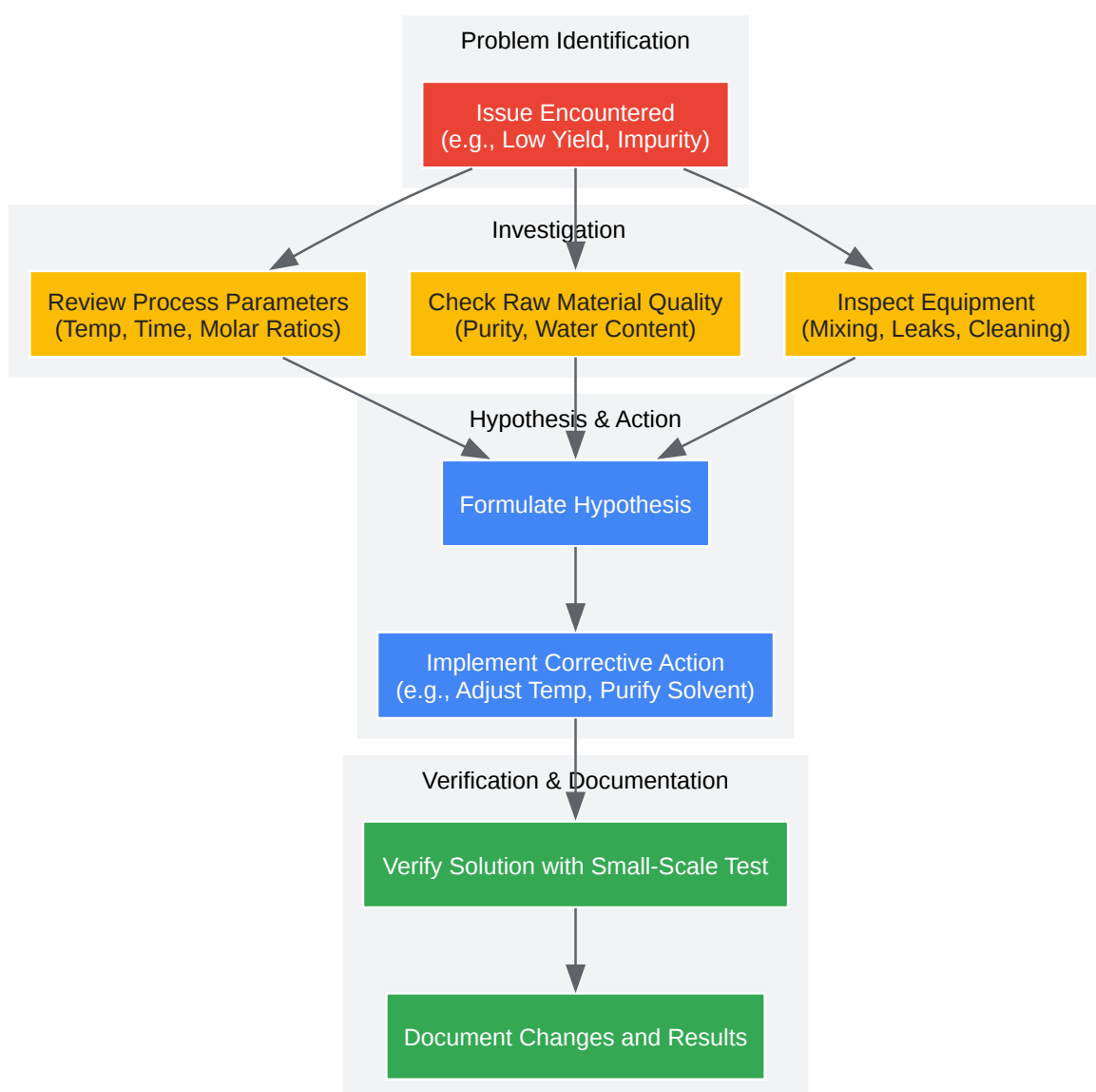
Diagram 1: General Troubleshooting Workflow for Large-Scale Synthesis

Click to download full resolution via product page