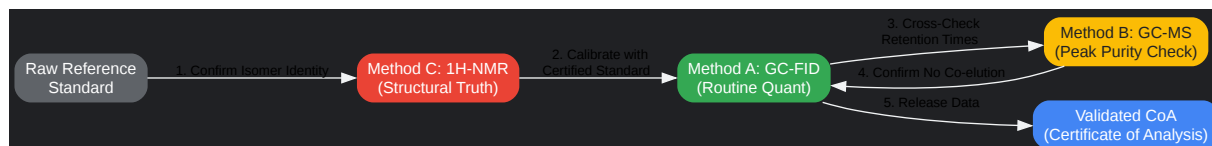
Diagram 1: The Cross-Validation Ecosystem

Click to download full resolution via product page